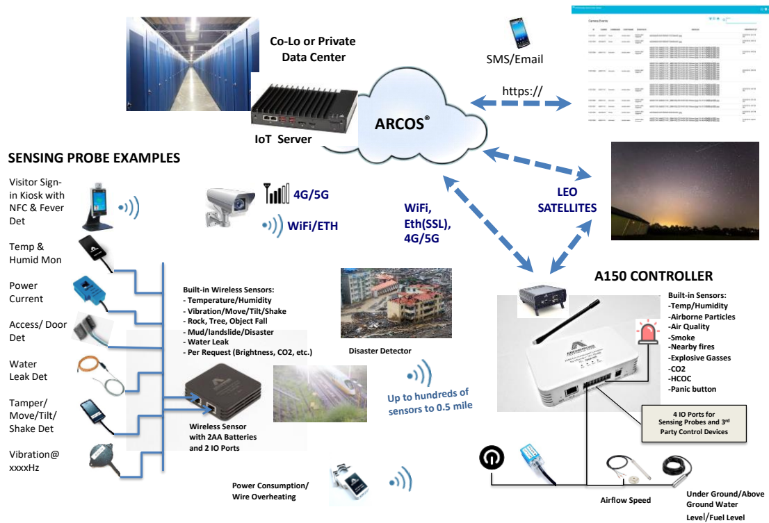
Figure1: Sample figure or caption text with sample image