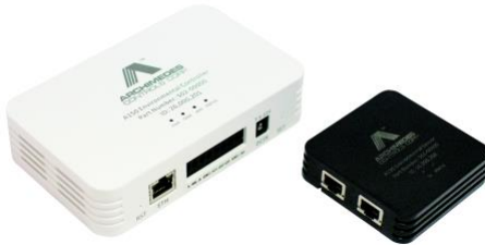
A150 Controller & A150 Sensor

SuperMicro's SYS-E100-12T Edge Server and Archimedes Controls' A150 Wireless IoT Sensors and Controller