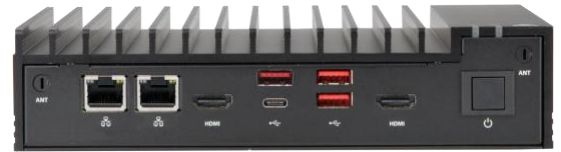
Supermicro's IoT Gateway Servers Teamed with Archimedes A150 System