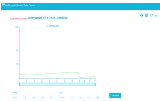
Power Consumption Histogram