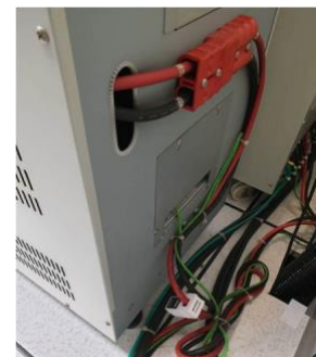
UPS Power Consumption Monitoring